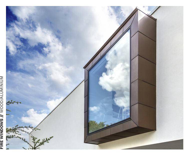
FIRE WINDOWS // WOOD/ALUMINIUM