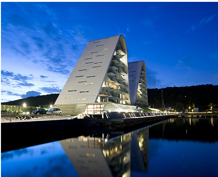
COTO 62 // WOOD/ALUMINIUM