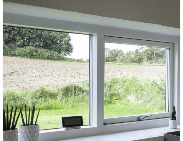
COTO 62 // WOOD/ALUMINIUM