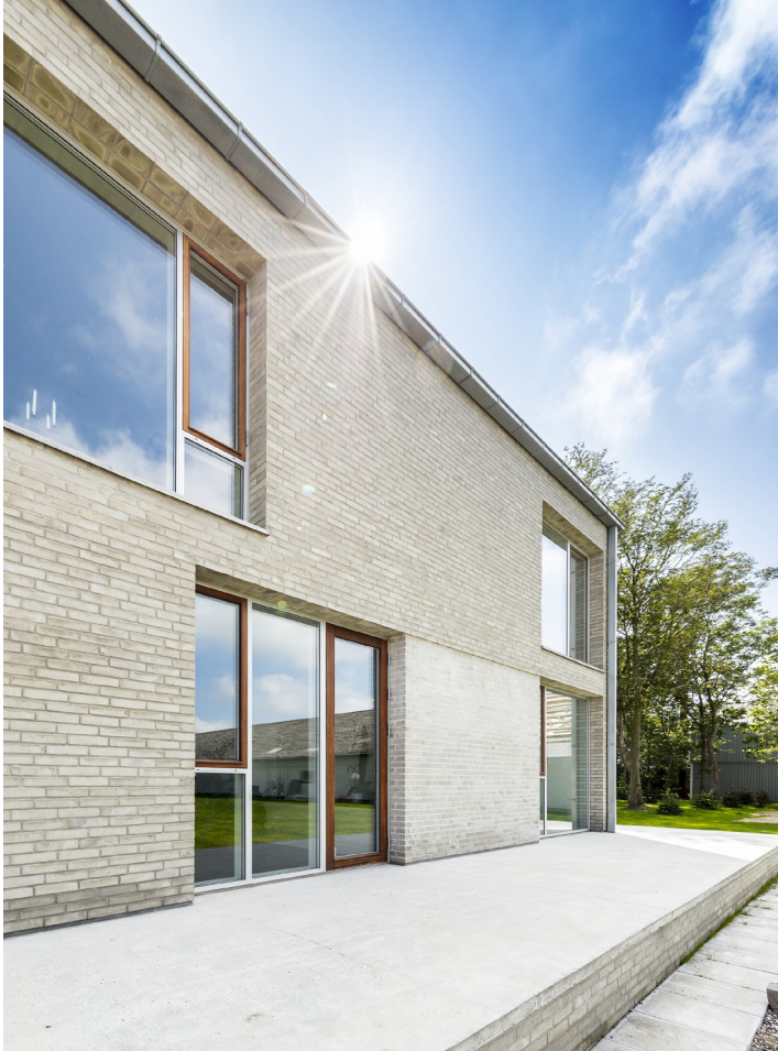
COTO 62 // WOOD/ALUMINIUM