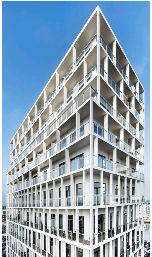
KRONE COTO 62 // WOOD/ALUMINIUM