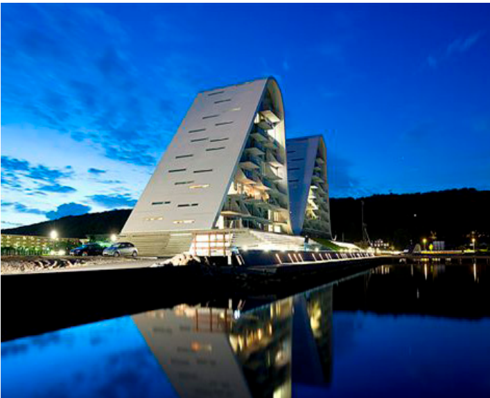
KRONE COTO 62 // WOOD/ALUMINIUM