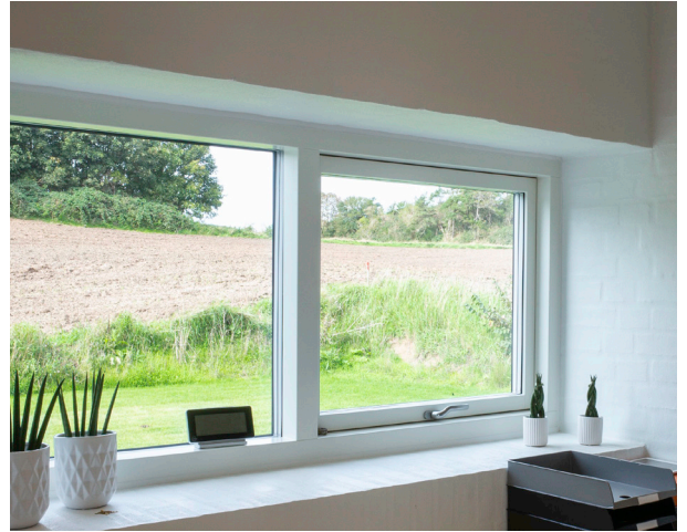
KRONE COTO 62 // WOOD/ALUMINIUM