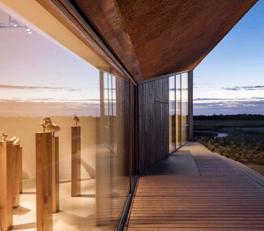
Oak windows and doors