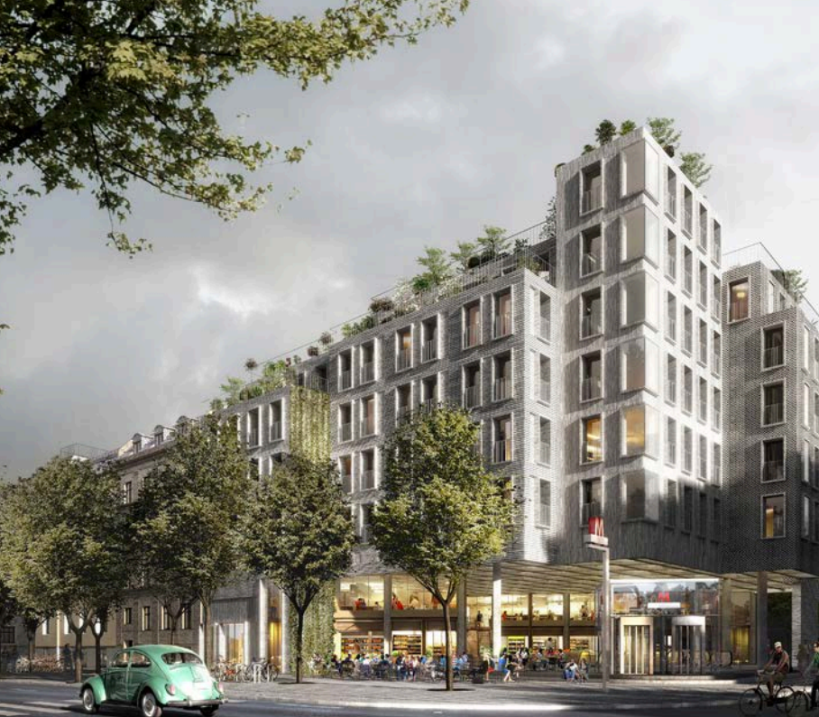
PROJECT FREDERIKSBERG ALLÉ 41, COPENHAGEN // COBE ARCHITECTS