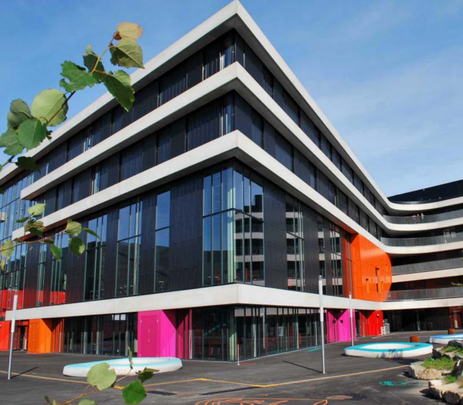
THOR HEYERDAHL SCHOOL, LARVIK // SCHMIDT/HAMMER/LASSEN ARCHITECTS