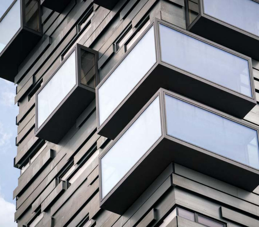
Oak/aluminium windows, glass bays and small corner posts