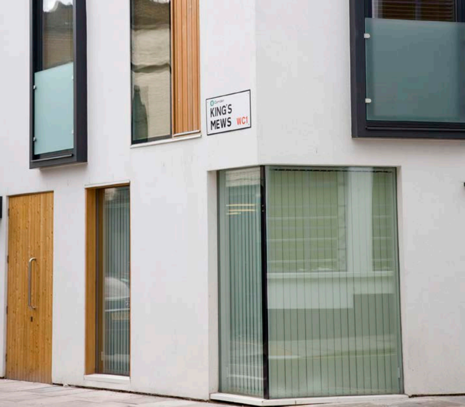
Wood/aluminium windows and doors. Panels in larch wood and frames with glued-on glass