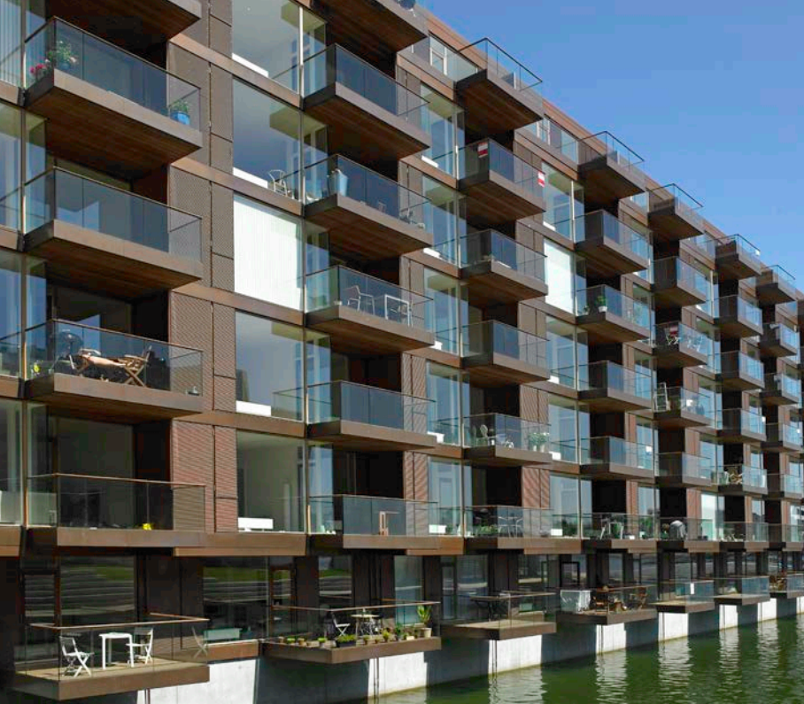
FREDERIKSKAJ, COPENHAGEN // DISSING+WEITLING ARCHITECTS