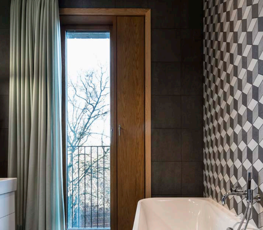
Oak/aluminium windows, doors, sliding doors and special window ventilation