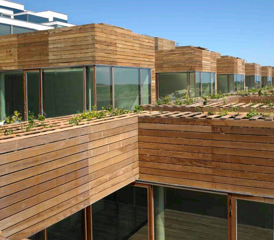
Full height mahogany windows and doors and aluminium glazing beads