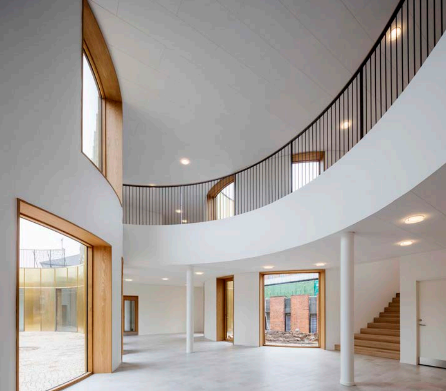
Curved oak/kebon windows with glazing beads in tombac