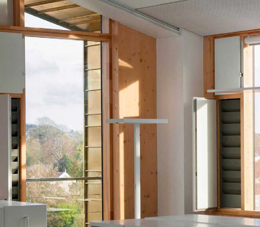
Wood/aluminium windows and doors, acoustic panels, deep frames and motorized window ventilation