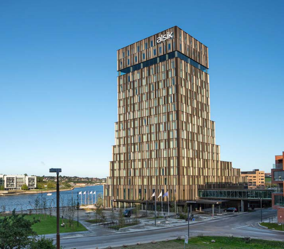
SØNDERBORG TOWER, SØNDERBORG // HENNING LARSEN ARCHITECTS