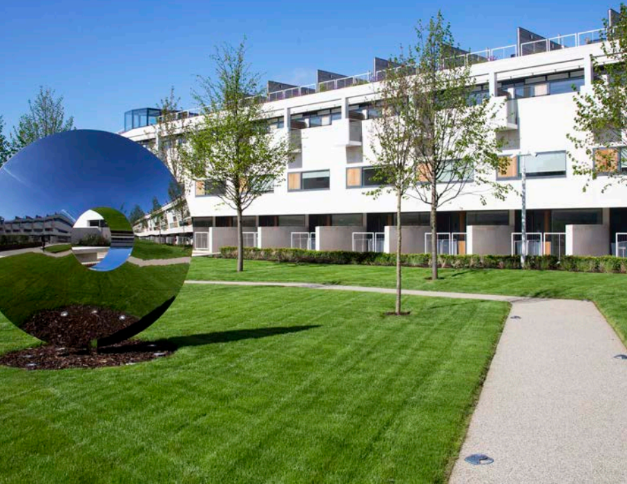
GABRIEL SQUARE ST ALBANS, LONDON AREA // BENSON & FORSYTH ARCHITECTS