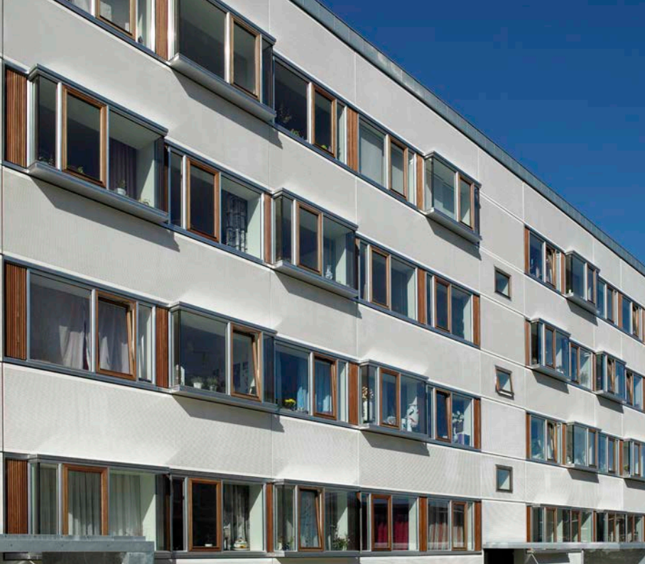
GYLDENRISPARKEN, COPENHAGEN // VANDKUNSTEN, WITRAZ & WISSENBORG ARCHITECTS