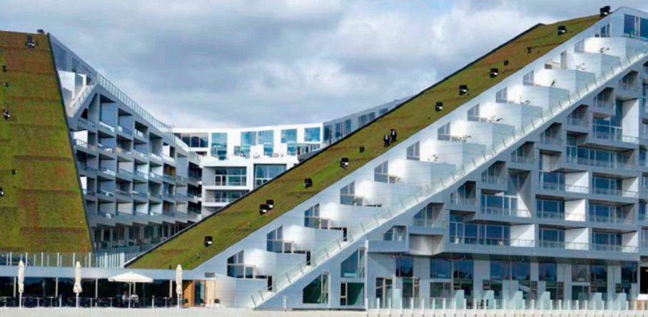
8 TALLET, COPENHAGEN // BJARKE INGELS GROUP