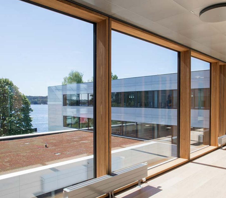
Oak/aluminium windows and doors, deep oak frames and glass to glass corners