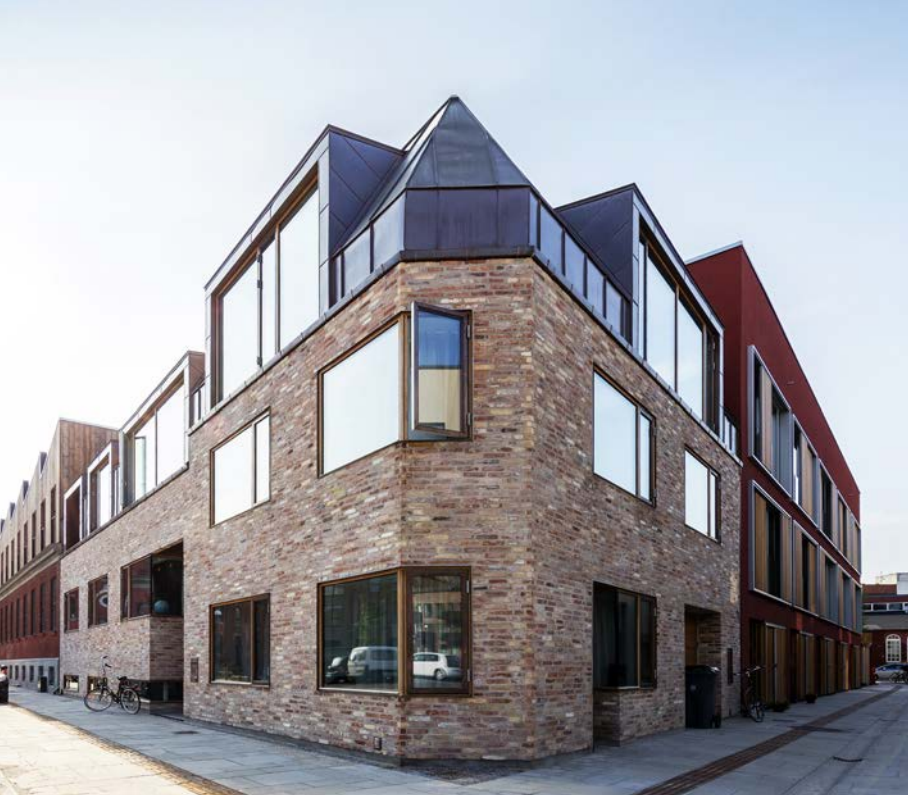
PRIVATE HOME, COPENHAGEN //