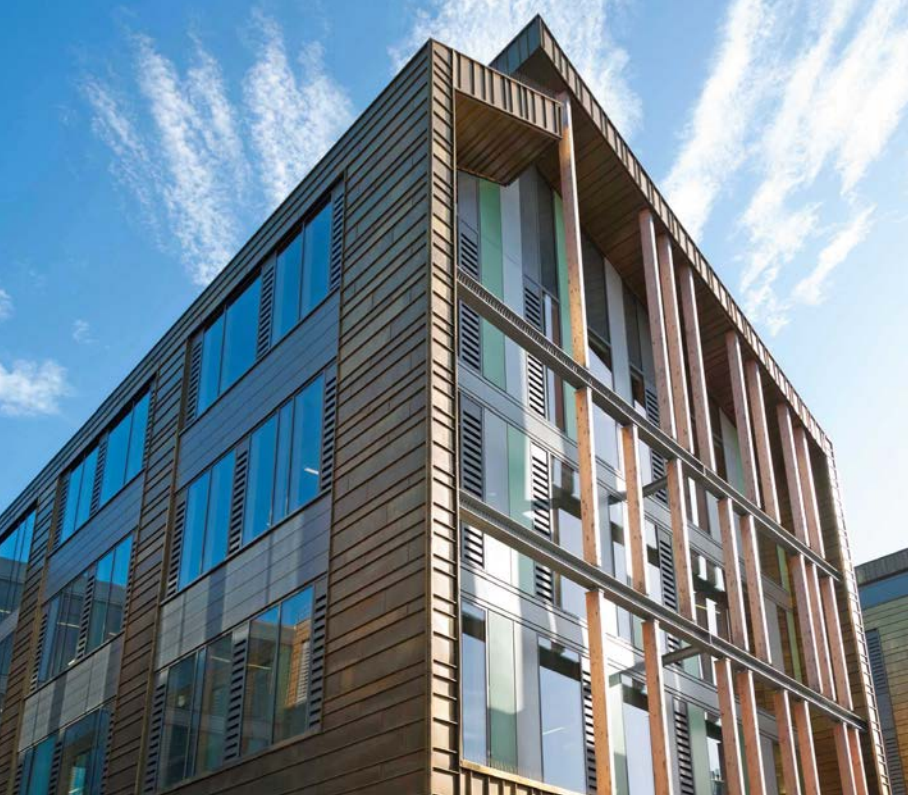
KEYNSHAM TOWN HALL, BRISTOL // AEDAS ARCHITECTURE