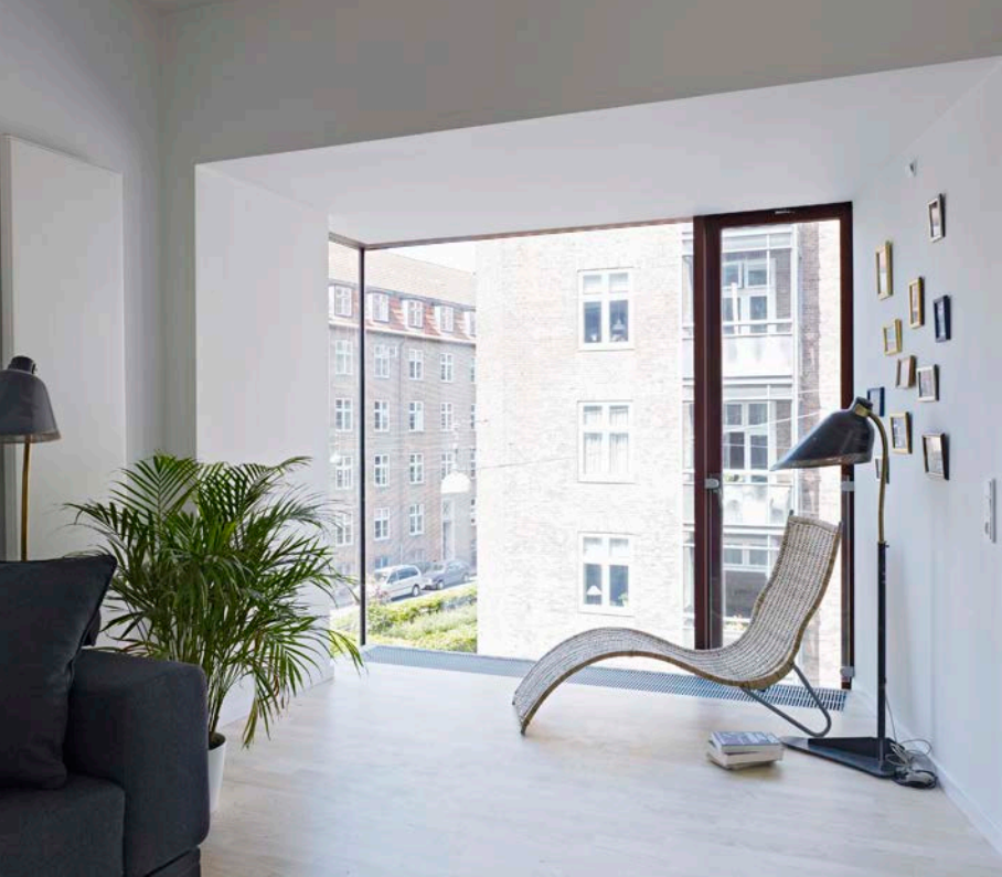
Glass to glass corners