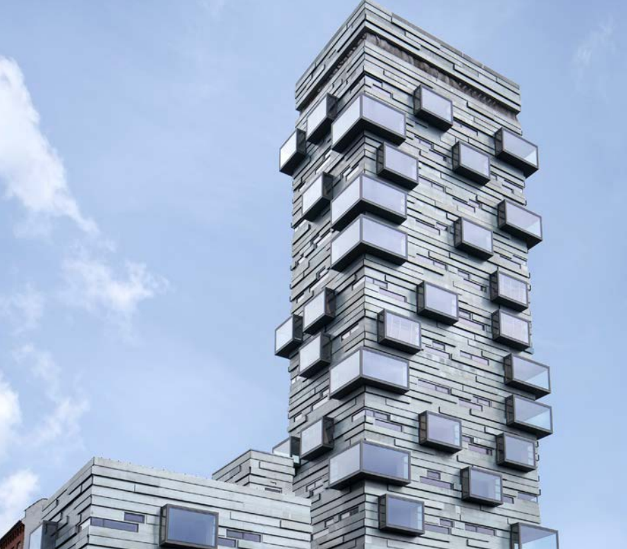
CHARLOTTETÅRNET, COPENHAGEN // LUNGAARD & TRANBERG ARCHITECTS