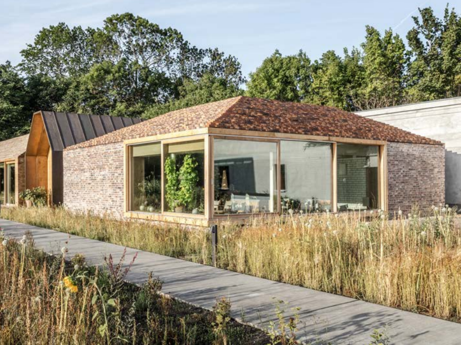
NOMA, COPENHAGEN // BJARKE INGELS GROUP