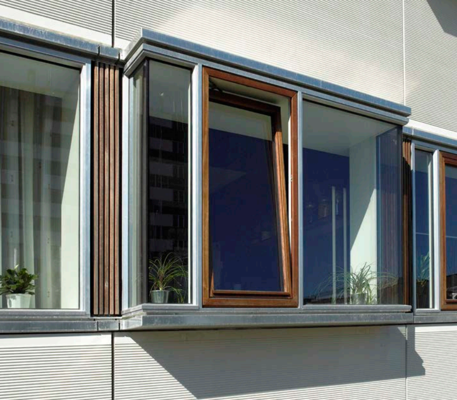
Mahogany/aluminium tilt/turn windows and glass to glass corners