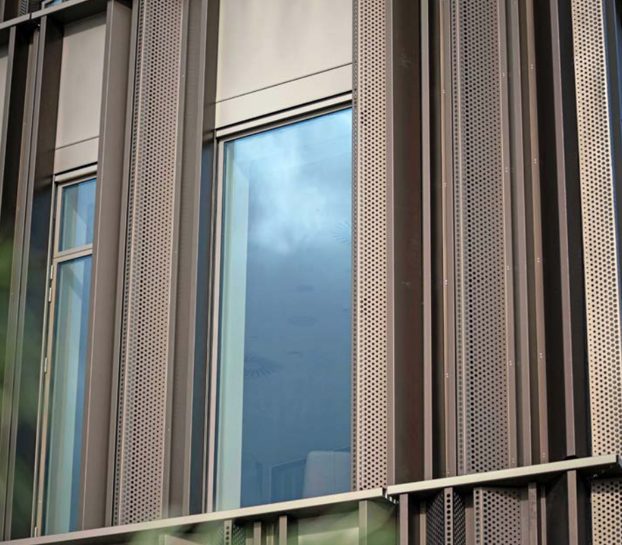
Windows and doors in composite