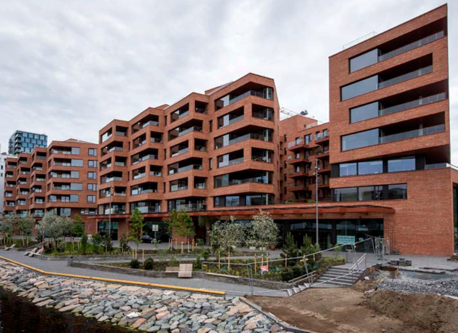
MUNCH BRYGGE, OSLO // LUND+SLAATTO ARCHITECTS