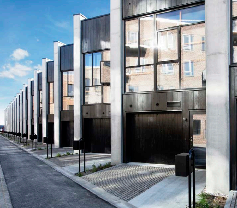
UPCYCLE STUDIOS, COPENHAGEN // LENDAGER GROUP ARCHITECTS