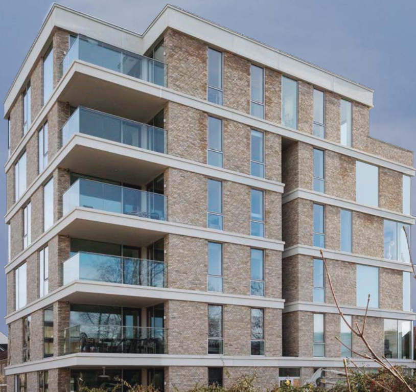
CHIMNEY HOUSE, COPENHAGEN // AARSTIDERNE ARCHITECTS