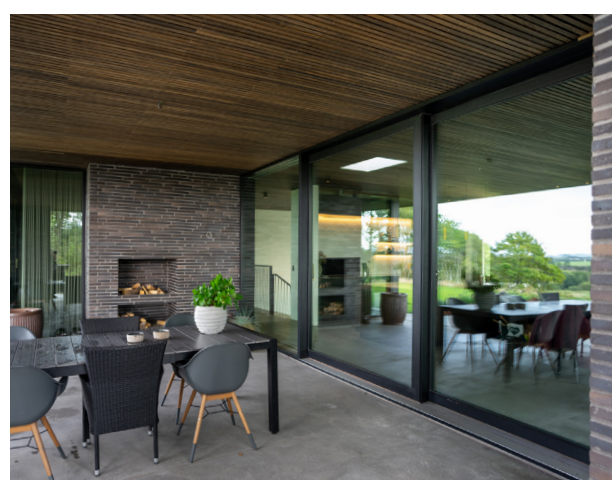
SLIDING DOOR // 3-PANELS WOOD/ALUMINIUM